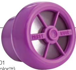
PMV® 2001 (Purple Color™)