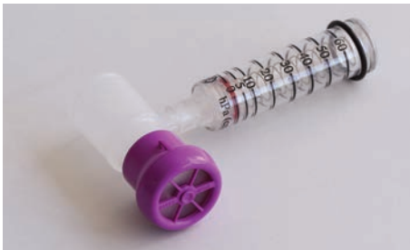
Example using a portable manometer